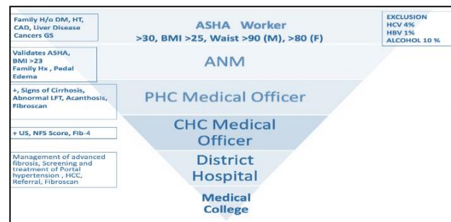
FIGURE 2 POPULATION BASED SCREENING FOR NAFLD IN INDIA.