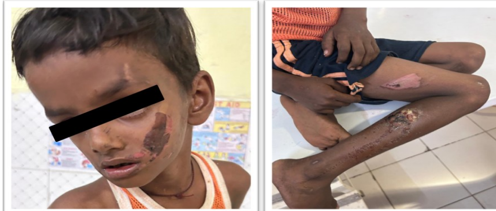
Figure 2. Burn injuries on the face and leg of the child