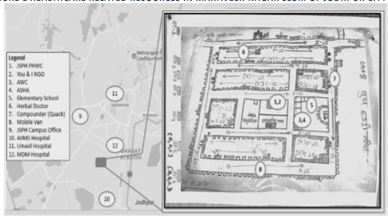
FIGURE 2 UTILIZATION PATTERN OF HEALTH CARE RESOURCES BY SLUM RESIDENTS